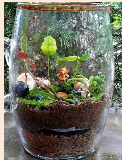
Terrarium prepared by one of the students of the B.Sc. (Horticulture) as a part of their assignment for the ornamental horticulture course.