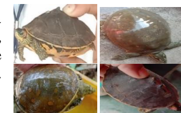
Different Tortoise species collected